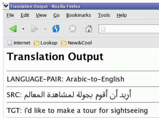
Figure 3: Example of an Arabic sentence translated into English.

Mauro Cettolo, Marcello Federico, Nicola Bertoldi, Roldano Cattoni, and Boxing Chen. 2005. A look inside the itc-irst smt system. In Proceedings of the 10th Machine Translation Summit , pages 451–457, Phuket, Thailand, September.