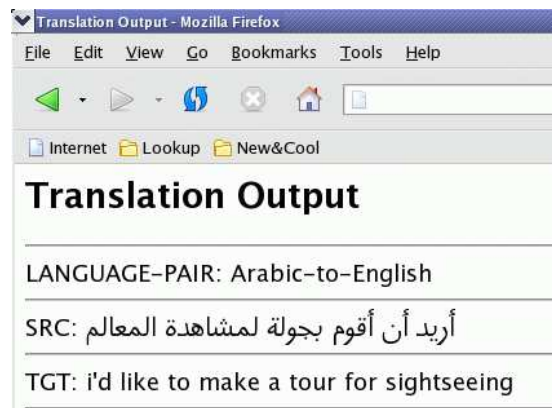
Figure 3: Example of an Arabic sentence translated into English.

Mauro Cettolo, Marcello Federico, Nicola Bertoldi, Roldano Cattoni, and Boxing Chen. 2005. A look inside the itc-irst smt system. In Proceedings of the 10th Machine Translation Summit , pages 451–457, Phuket, Thailand, September.